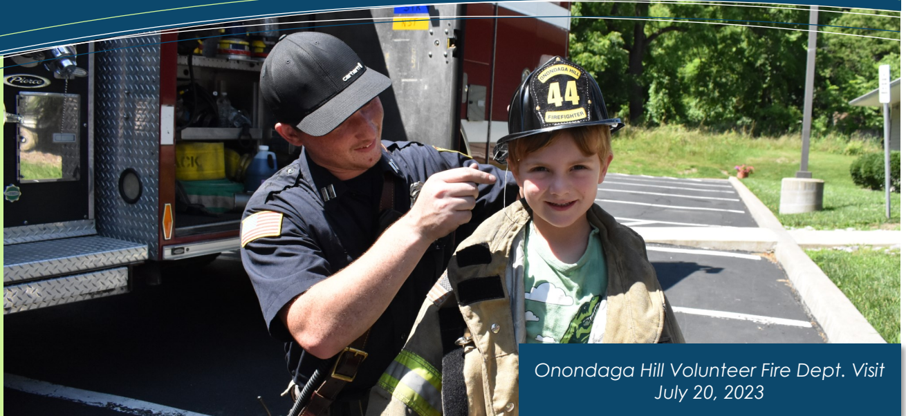
Onondaga Hill Volunteer Fire Dept. Visit July 20, 2023